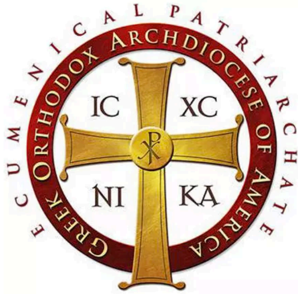
GREEK ORTHODOX METROPOLIS OF NEW JERSEY