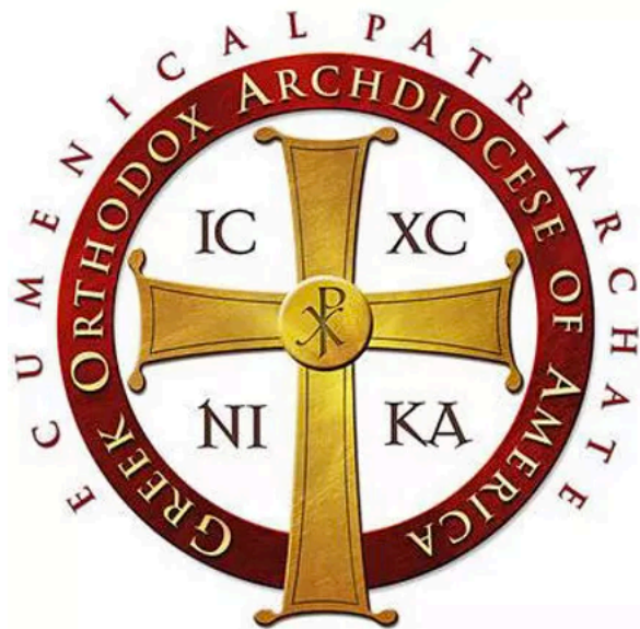
GREEK ORTHODOX METROPOLIS OF NEW JERSEY