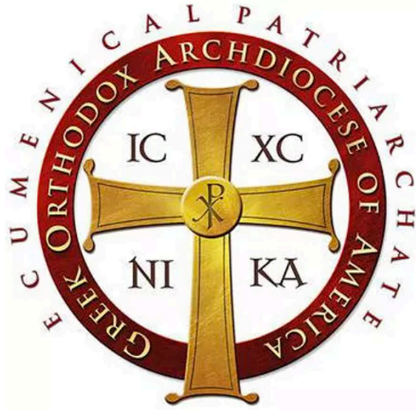
GREEK ORTHODOX METROPOLIS OF NEW JERSEY